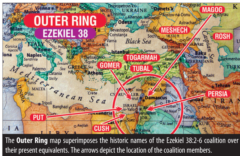
The Outer Ring map superimposes the historic names of the Ezekiel 38:2-6 coalition over their present equivalents. The arrows depict the location of the coalition members.

According to Psalm 83:9-11, the Inner Circle is defeated militarily by the Israeli Defense Forces (IDF). However, Ezekiel 38:18-39:6 describes the supernatural destruction of the Outer Ring via a great earthquake, flooding rain, great hailstones, fire, and brimstone. It's interesting to